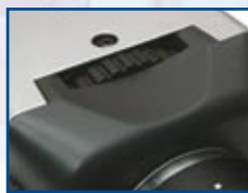
Back focus thumbwheel