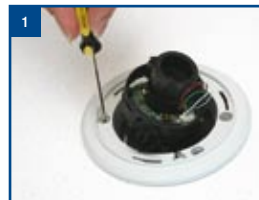
Tighten the fixing clamps